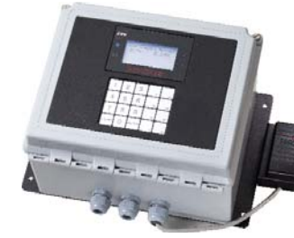
MAXIMUS SEVERE DUTY

A robust time and attendance solution featuring a NEMA 4X rated enclosure and IP65 certification. Designed with water-and-dust-tight seals for those who demand a feature-rich terminal that works in harsh environments. The Maximus Severe Duty provides cutting-edge technology and supports web services, open standards, complete field upgradeability, keypad and function customization, along with a variety of ID readers, optional Java™ programmability, optional heaters, and more.